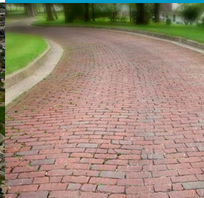
BRICK ROAD PATH