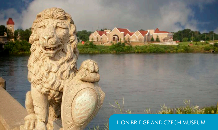
LION BRIDGE AND CZECH MUSEUM

UnityPoint Health® - St. Luke's Foundation is harnessing the Healing Power of Art to benefit cancer patients and their families. You can help by sponsoring the placement of timeless photographic images throughout the Community Cancer Center and St. Luke's Radiation Center.