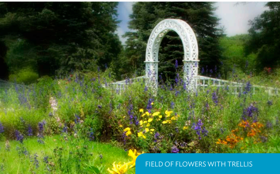
FIELD OF FLOWERS WITH TRELLIS