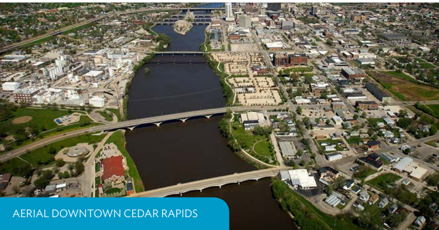
AERIAL DOWNTOWN CEDAR RAPIDS